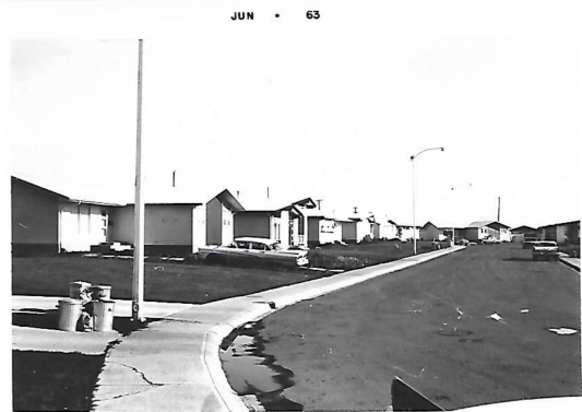
At 7306 – 155 Street Looking north along 155 Street Looks like it is "garbage day"