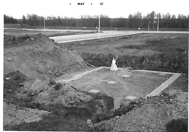
At 7306 – 155 Street Looking southeast towards Rio Terrace Drive Note bush on south edge of the Drive