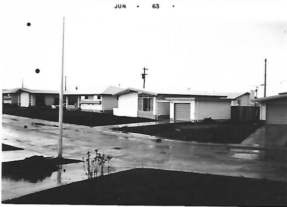
At 7306 – 155 Street Looking northeast A rainy day in Rio